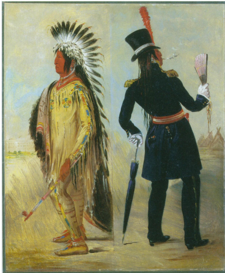
George Catlin, "Pigeon's Egg Head (The Light), Going to and returning from Washington," oil painting ca. 1837-1839.

institutions, settlers sought to distinguish themselves ethnically, physically, and culturally from the natives. The rules that applied to Europeans would be different from those that were appropriate for