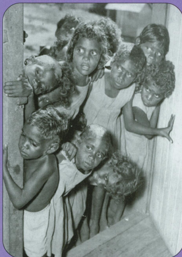
Aboriginal children peek inside a doorway during a Flying Doctors Service visit to the Australian outback, 1940